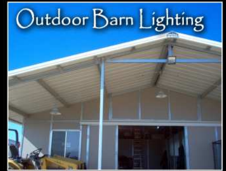
Outdoor Barn Lighting