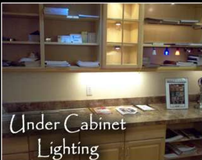
Under Cabinet Lighting