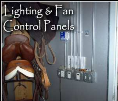
Lighting & Fan Control Panels